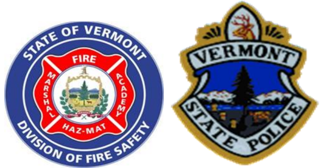
Vermont Dept. of Public Safety Fire & Explosion Investigation Unit